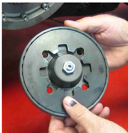
Place BDL diaphragm over ball bearings on pressure plate.