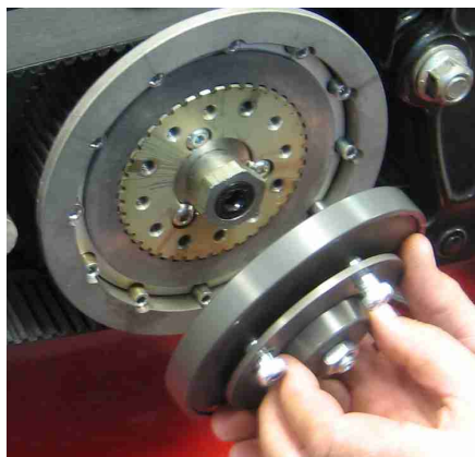
Holding assembly with pressure against the diaphragm so that the ball bearings are secured, place assembly on to clutch basket.