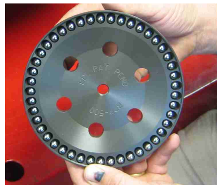
BPP-500 Lock up for HD 1998-2007 BDL pressure plate with 45- 5/16" chromium steel ball bearings. Install with stock HD diaphragm, retainer and bolts and install as per HD manuel. Re-adjust clutch as per HD manuel.