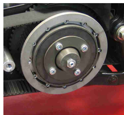
Tighten shoulder bolts down to approx. 25 TO 30 foot pounds.