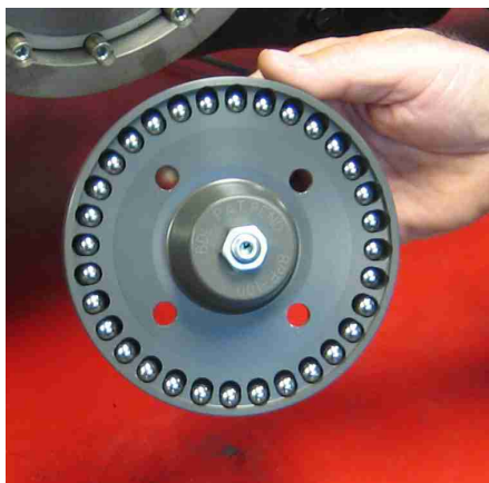
BPP-100 BDL pressure plate with 32 - 3/8" chromium steel ball bearings and special adjustment screw and nut.