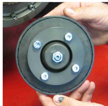
Place BDL retainer over diaphragm and insert shoulder bolts.