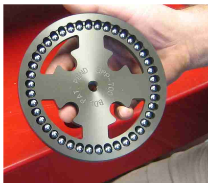
BPP-700 Lock up for Primo belt drives 1990-2007. Pressure plate with 42-5/16 " chromium steel ball bearings.