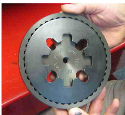
Place BDL diaphragm over ball bearings then use Primo retainer, adjustment screw and bolts and install assembly onto Primo clutch basket using procedure outlined above. Re-adjust clutch per Primo instructions.